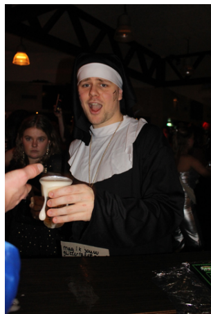
How to order beer like a true sister #amen